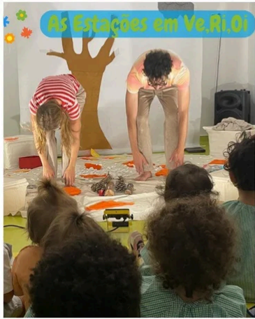
As Estações em Ve.Ri.O!