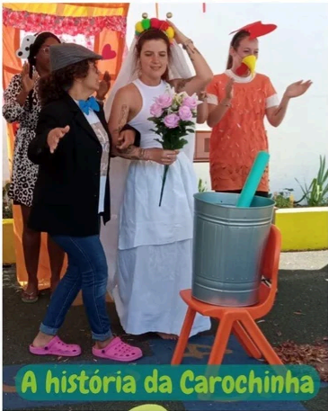
A história da Carochinha