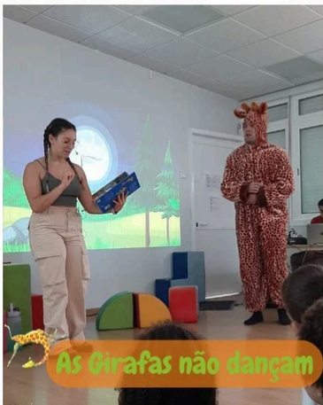
As Girafas não dançam